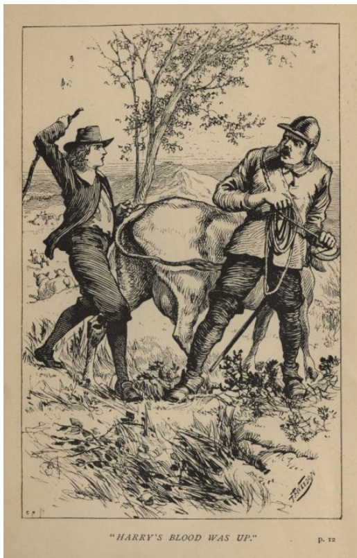
"HARRY'S BLOOD WAS UP."