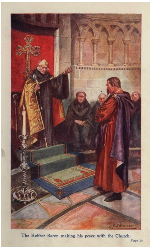
The Robber Baron making his peace with the Church.

suitable homily, adorned with texts and quotations, on the special subject of the readiness of the Church to receive sinners back to her arms. It concluded with a broad hint that the abbey should be compensated for the harm done to her; but it was a guarded discourse, for the abbot could not tell how the dreaded tyrant might receive his suggestion.