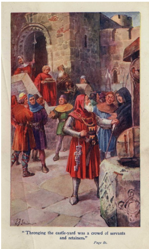
"Thronging the castle-yard was a crowd of servants and retainers."