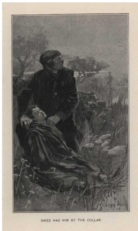
SIKES HAD HIM BY THE COLLAR.