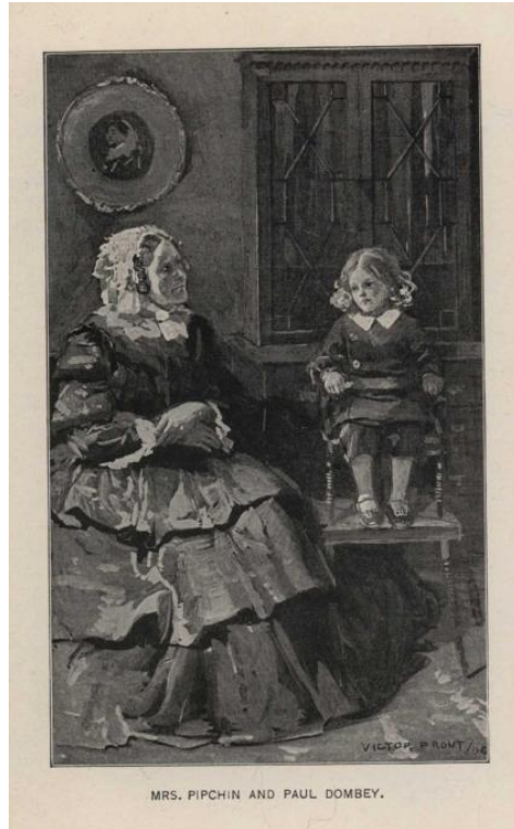
MRS. PIPCHIN AND PAUL DOMBEY.

His sister laughed and fondled him, and told him "No."