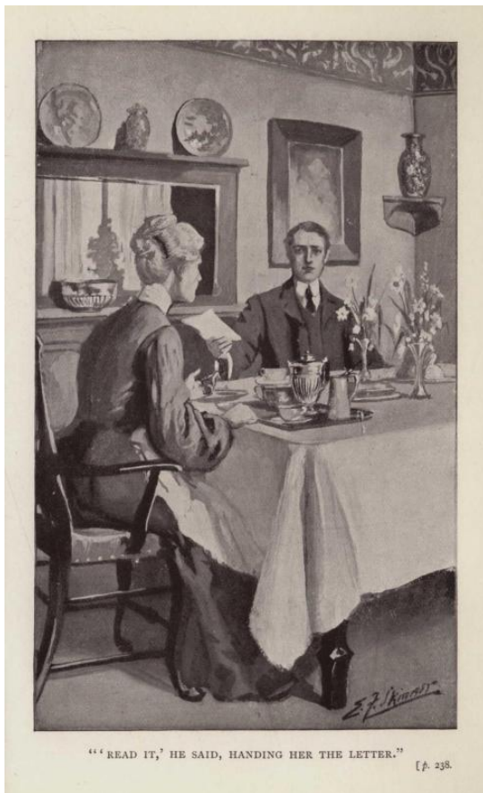
"READ IT," HE SAID, HANDING HER THE LETTER."