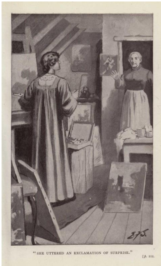
"SHE UTTERED AN EXCLAMATION OF SURPRISE."