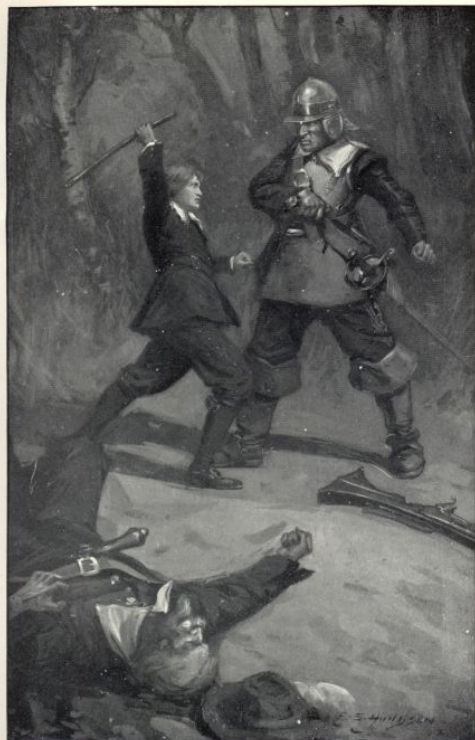
“I RAN AT MY FATHER’S MURDERER AND RAINED BLOW AFTER BLOW UPON HIS HEAD AND BODY”