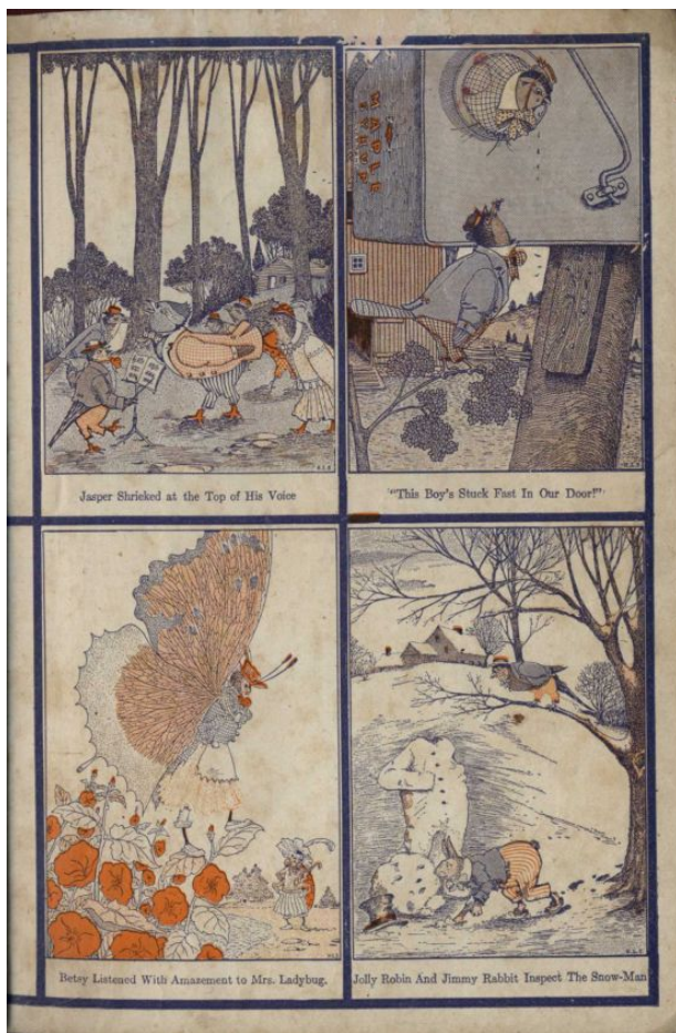
Front end paper - right half