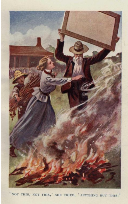
'NOT THIS, NOT THIS,' SHE CRIED, 'ANYTHING BUT THIS.'