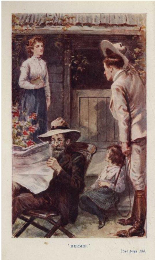
'HERMIE.' (See page 134.)