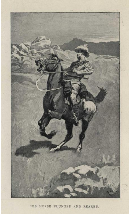
HIS HORSE PLUNGED AND REARED.

absurd, for no shrub was more than two or three feet high. He raised his revolver; his finger was at the trigger. Then he saw three small faces over the edge of one of the bushes—three that he knew; they were the stolid, secret-looking little boys who had lighted him to the stable last night.