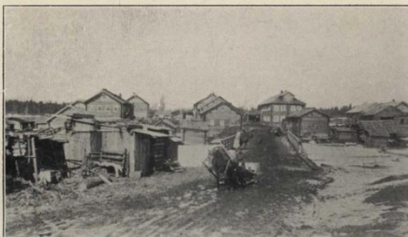
Russians love their homes and their villages devotedly.

The women work in the fields with the men. Russians love their homes and their villages devotedly.