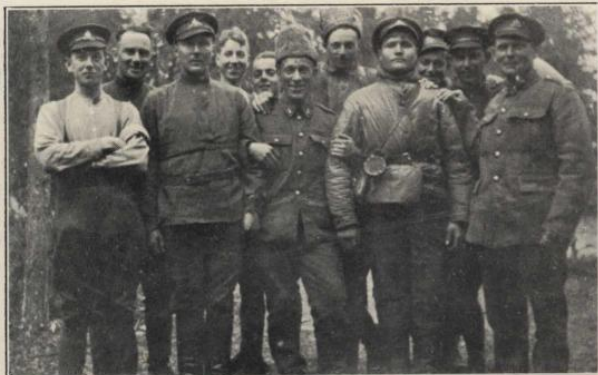
Canadian soldiers with two captives, having changed caps.