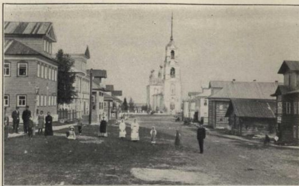
The church at Yemetskoye is visible for many miles up the Dvina.