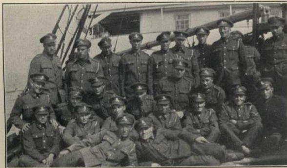
These Canadians fought in France before they went to Russia.

The "Y" was always on the job. These Canadians fought in France before they went to Russia.