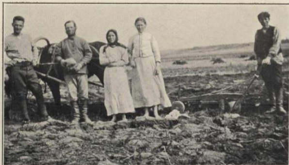
The women work in the fields with the men.