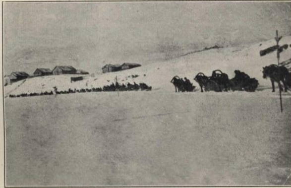
This was our only possible communication with Archangel, 300 miles to the north.

The American Engineers built scores of block houses like this. This was our only possible communication with Archangel, 300 miles to the north.