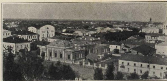
Archangel has many excellent and substantial buildings.