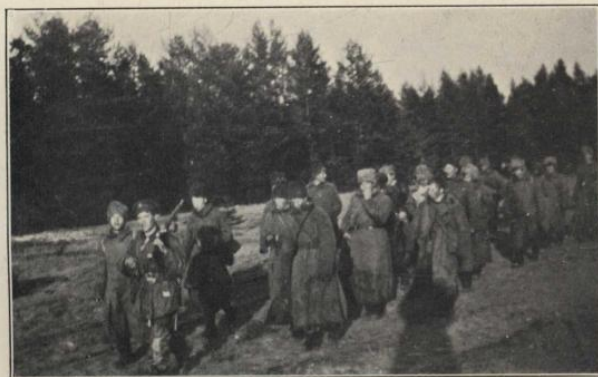
Bringing Bolsheviki prisoners into Malobereznik.

Canadian soldiers with two captives, having changed caps. Bringing Bolsheviki prisoners into Malobereznik.