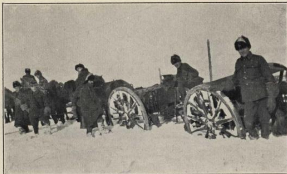
The Canadian artillery got there every time.