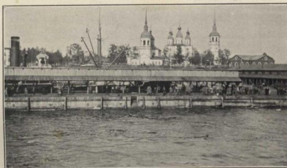
The Archangel water-front has miles of good docking facilities.

Archangel has many excellent and substantial buildings. The Archangel water-front has miles of good docking facilities.