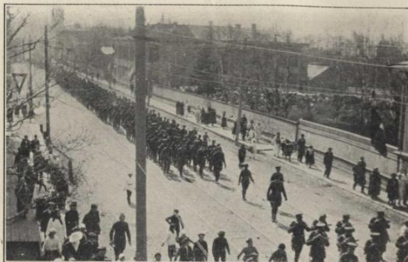
The new British army entered Archangel in June with great pomp and ceremony.