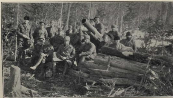
This Russian gun crew on the railroad front enjoys warmer weather.

The Canadian artillery got there every time. This Russian gun crew on the railroad front enjoys warmer weather.