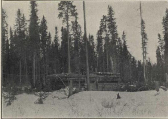
The American Engineers built scores of block houses like this.