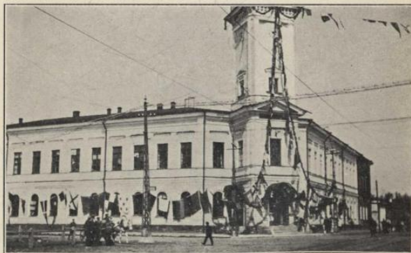
The Duma building at Archangel was decorated in honor of the new army that came to finish the Bolsheviki.

The new British army entered Archangel in June with great pomp and ceremony.