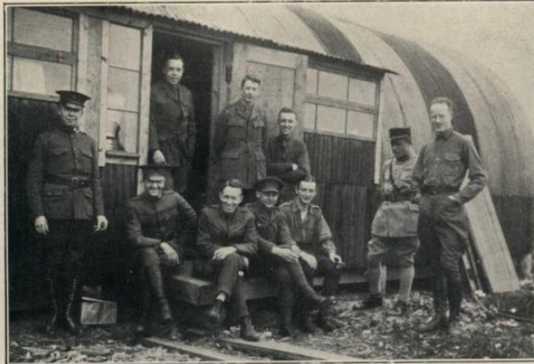
The "Y" was always on the job.