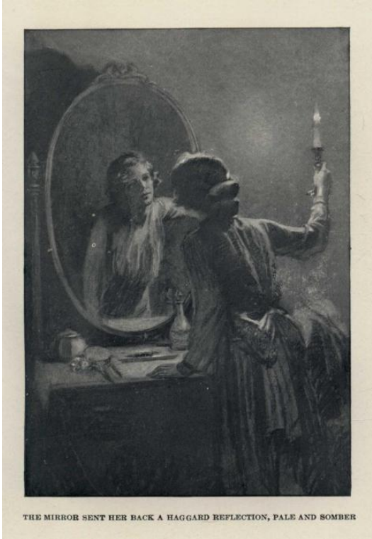
THE MIRROR SENT HER BACK A HAGGARD REFLECTION, PALE AND SOMBER