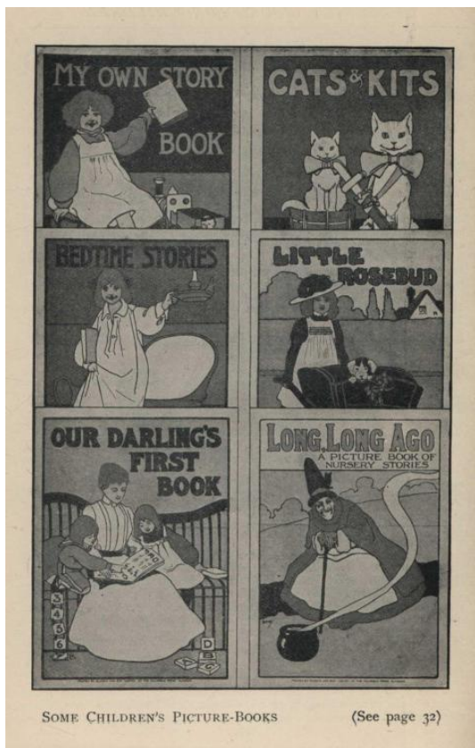
SOME CHILDREN'S PICTURE-BOOKS (See page 32)