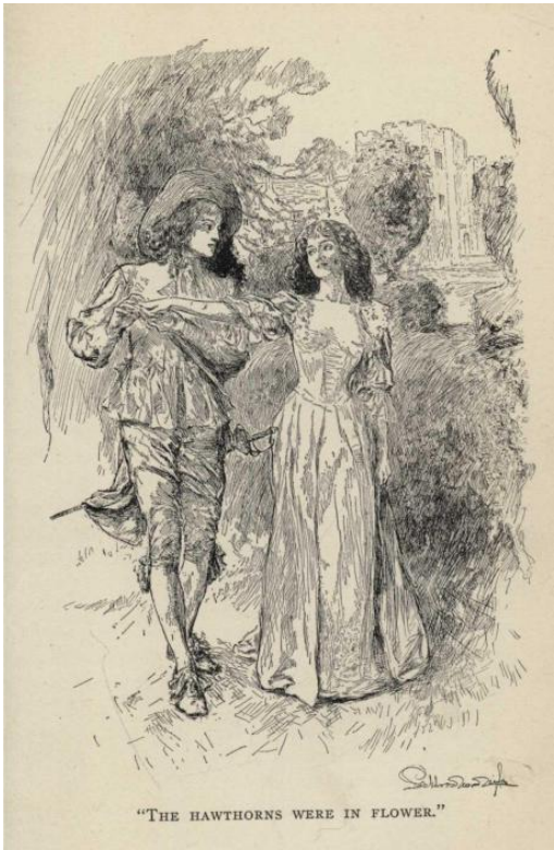
"THE HAWTHORNS WERE IN FLOWER."