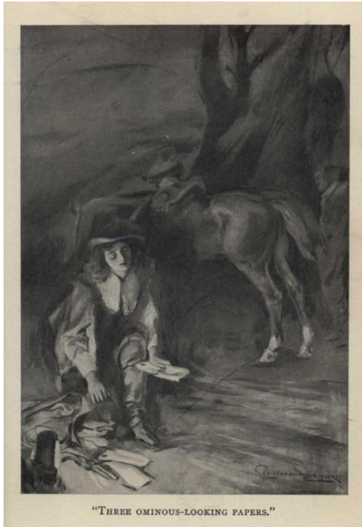
"THREE OMINOUS-LOOKING PAPERS."

bag, and turned the light upon its contents. The small private letters she hardly noticed, but there were three ominous-looking papers closed with large red seals, and these she instantly seized. They were all directed to the Sheriff of Ely; and she felt sure they were the authority for Stephen's arrest. She took possession of the whole three, bade Yupon set loose the horse, and leaving the other contents of the rifled mail-bag on the grass by the side of the bound carrier, she put into her companion's hand the promised gold pieces, and then slipped away into the shadows and darkness of de Wick chase.