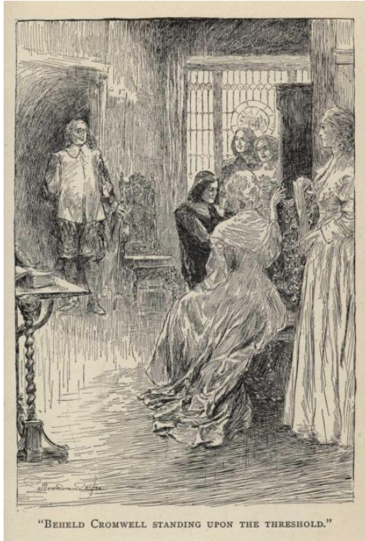
"BEHELD CROMWELL STANDING UPON THE THRESHOLD."