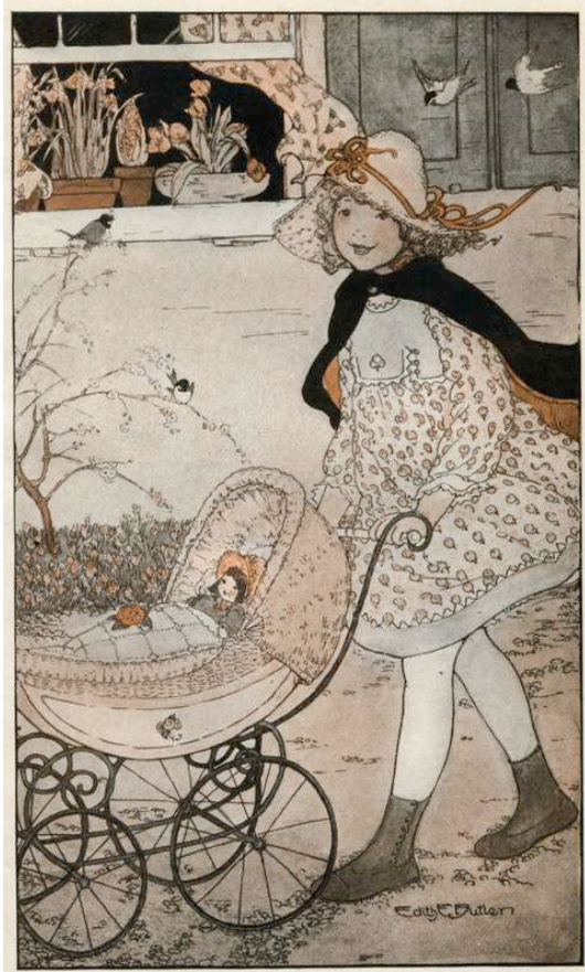
“IT’S SPRING, LUCY LOCKET,” CHATTERED LYDIA. “THAT’S WHY YOU HAVE A NEW HAT AND A NEW DRESS”