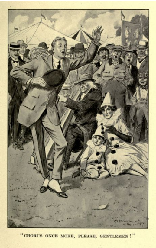
"CHORUS ONCE MORE, PLEASE, GENTLEMEN!"