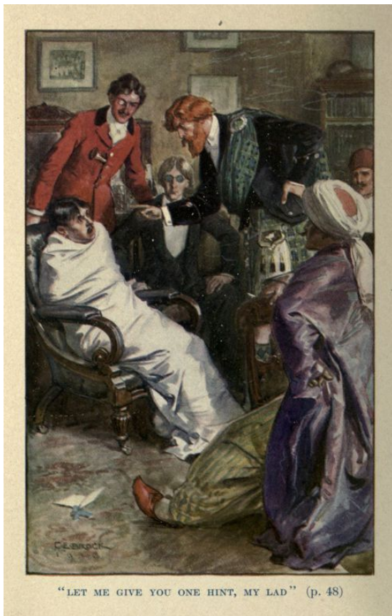
"LET ME GIVE YOU ONE HINT, MY LAD" (p. 48)