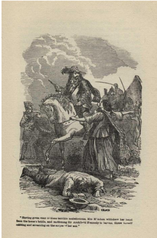
"Having given vent to these terrible maledictions, Mrs M'Adam withdrew her hand from the horse's bridle, and motioning Sir Archibald Kennedy to be gone, threw herself sobbing and screaming on the corpse of her son."