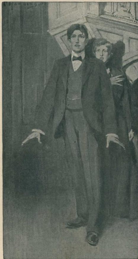
"It's a storm!" he cried. (See page 90.)