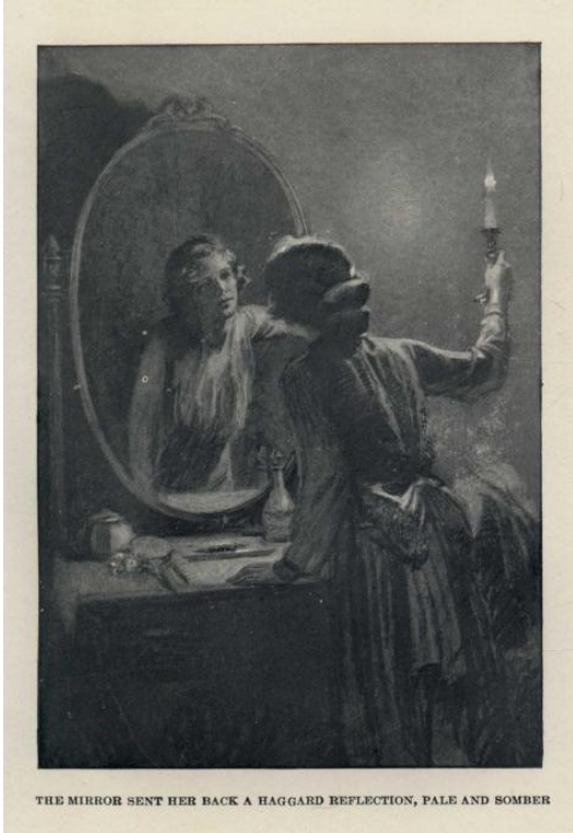
THE MIRROR SENT HER BACK A HAGGARD REFLECTION, PALE AND SOMBER