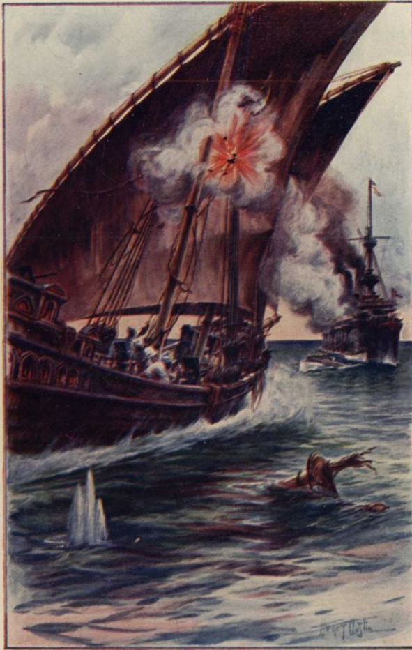
"A shell from the Breezy went screaming through her rigging." The Sauciest Boy in the Service [Page 183]

"A shell from the Breezy went screaming through her rigging."