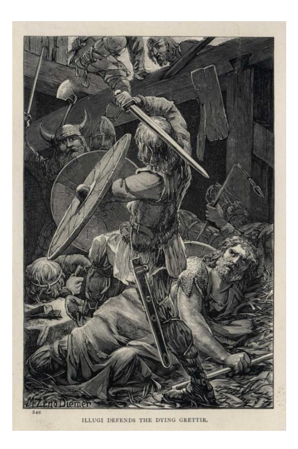
ILLUGI DEFENDS THE DYING GRETTIR.