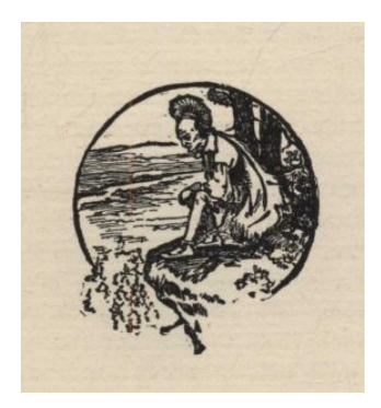
Chapter I tailpiece